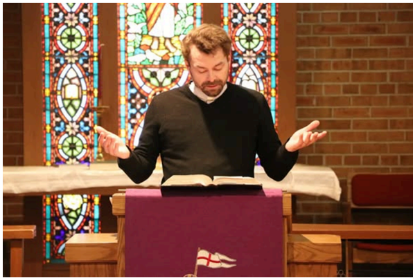
Midweek Late Lunch Lent Service

We invite you to submit any pictures, fun news, etc. to the RLC Office to include in our next newsletter.